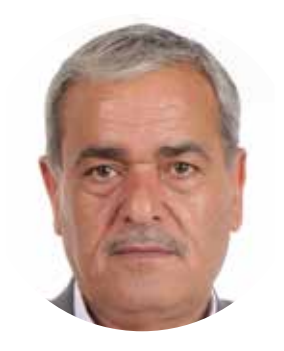
HASSAN AL-RAHIBH Municipality of Umm El Jimal Mayor JORDAN